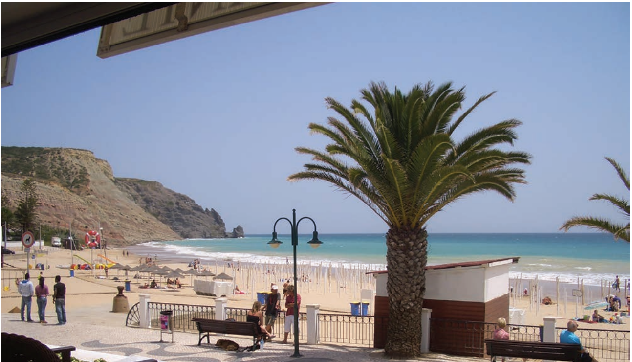
Fig. 2.2 for Question 2