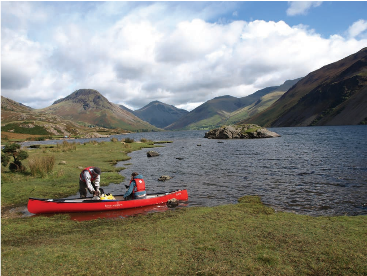
Fig. 6.2 for Question 6